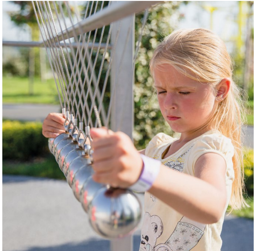
Order No. 10.11010 Impulse Spheres with Frame made of stainless steel