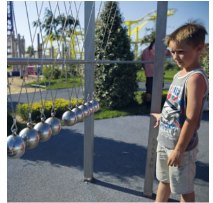
Order No. 10.11010 Impulse Spheres with Frame made of stainless steel