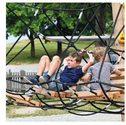
Order No. 13.01001 Optionally available element