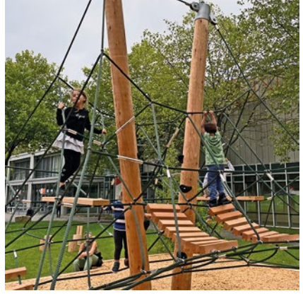
Order No. 13.01000 Small Net Pyramid.

"The best preparation for maths is not practising maths, but climbing trees," says renowned neurobiologist Gerald Hüther. Climbing connects both sides of the brain and promotes motor, cognitive and social skills. In addition, children learn to take responsibility in a playful way. With the Net Pyramid, we experience these phenomena. In addition, its interesting design attracts attention from afar. The three-dimensional net structure of the equipment provides children with a variety of challenges and stimulates their creativity. The Net Pyramid can be climbed, scaled, and explored.