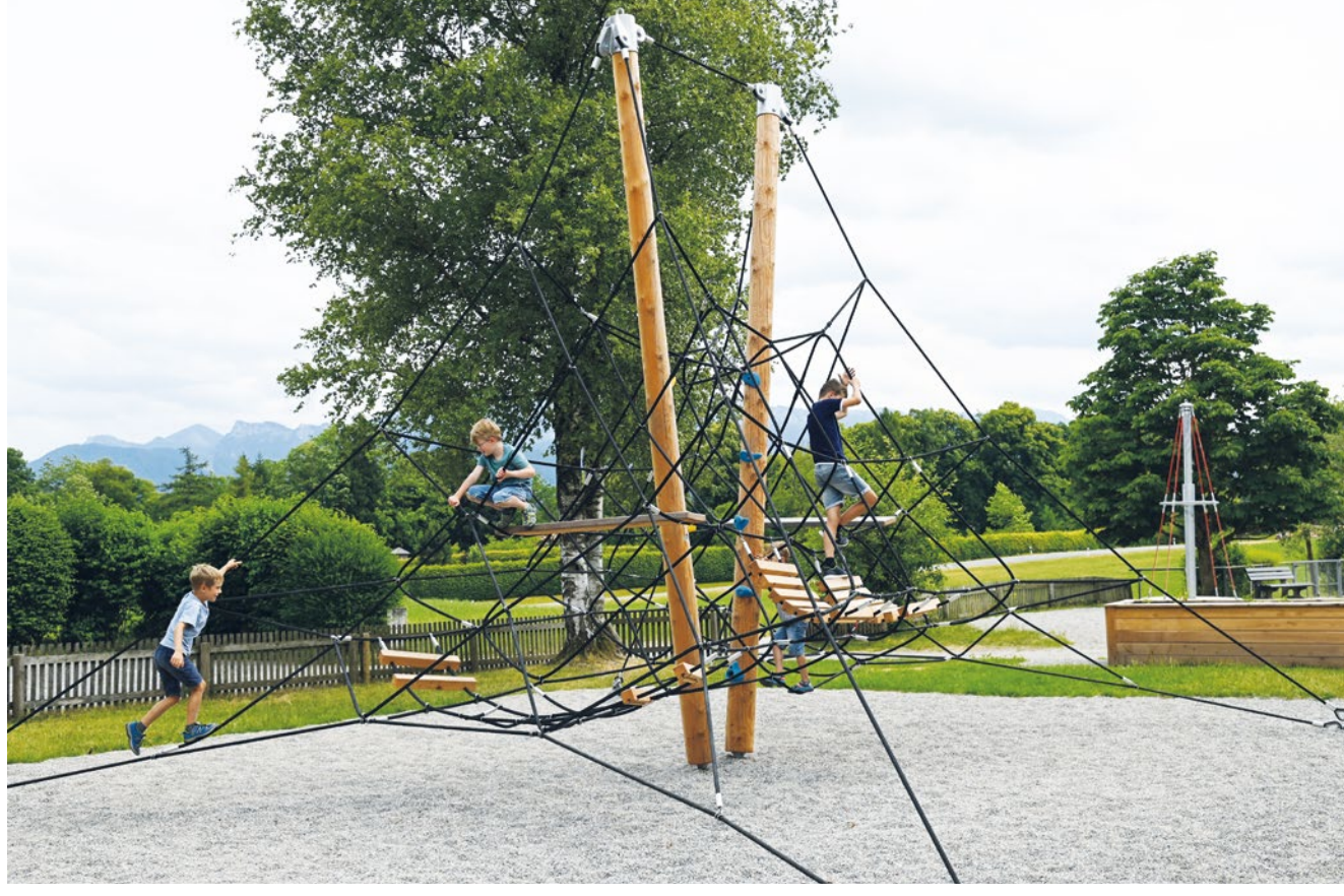
Order No. 13.02000 Middle Net Pyramid. The Photo shows the basic equipment incl. all optionally available installation elements.

It enables children to experience height and creates tactile sensations to their hands and feet. In addition, the equipment offers attractive seating for resting, observing, and talking, e.g., if supplemented by our optional hanging seats. Different levels and paths, which encourage a wide variety of movement and role-playing games, also promote concentration and dexterity.