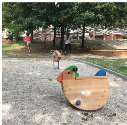
Order No. 4.08100 Little Chicken