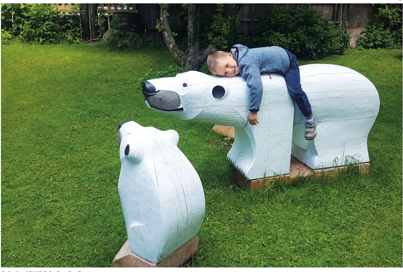
Order No. 4.51100 Polar Bear Family