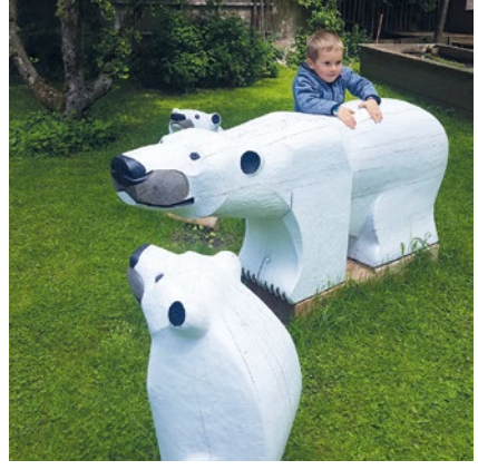
Order No. 4.51100 Polar Bear Family

The gentle nature of these play and art figures with their calm expressions create an atmosphere of peace that promotes friendly interaction. The sculptures – each is a unique specimen – are made of mountain larch. They invite children to stroke, touch and feel them, but they can also be sat upon or incorporated into role-playing games. Play figures such as these are something very special – they strengthen the identity of a playground.