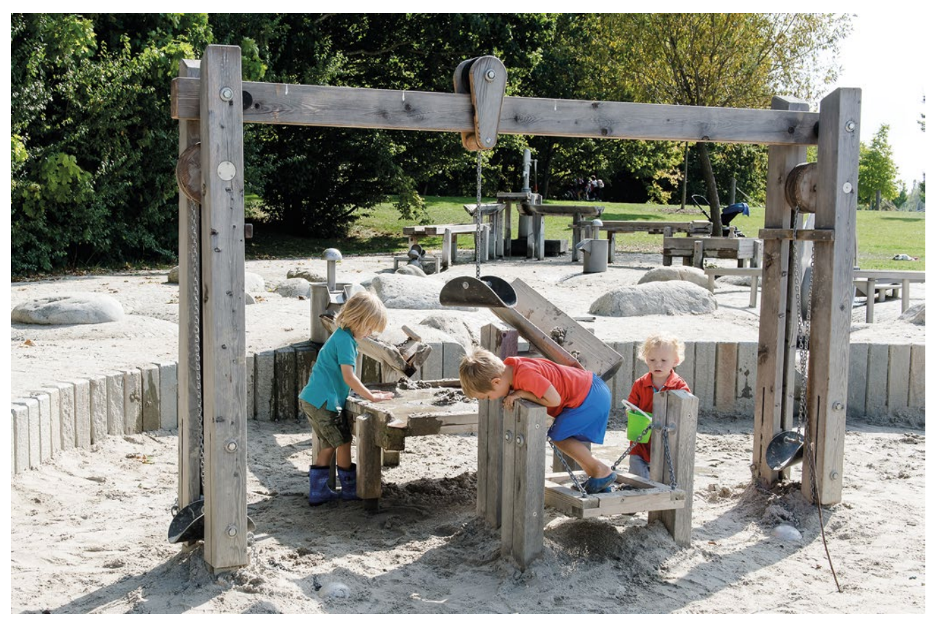
Small Building Site

The play possibilities of the Small Building Site contain operations similar to the working world of adults which can be copied. The technical design is attracting and motivating, the work processes encourage communication and cooperation.