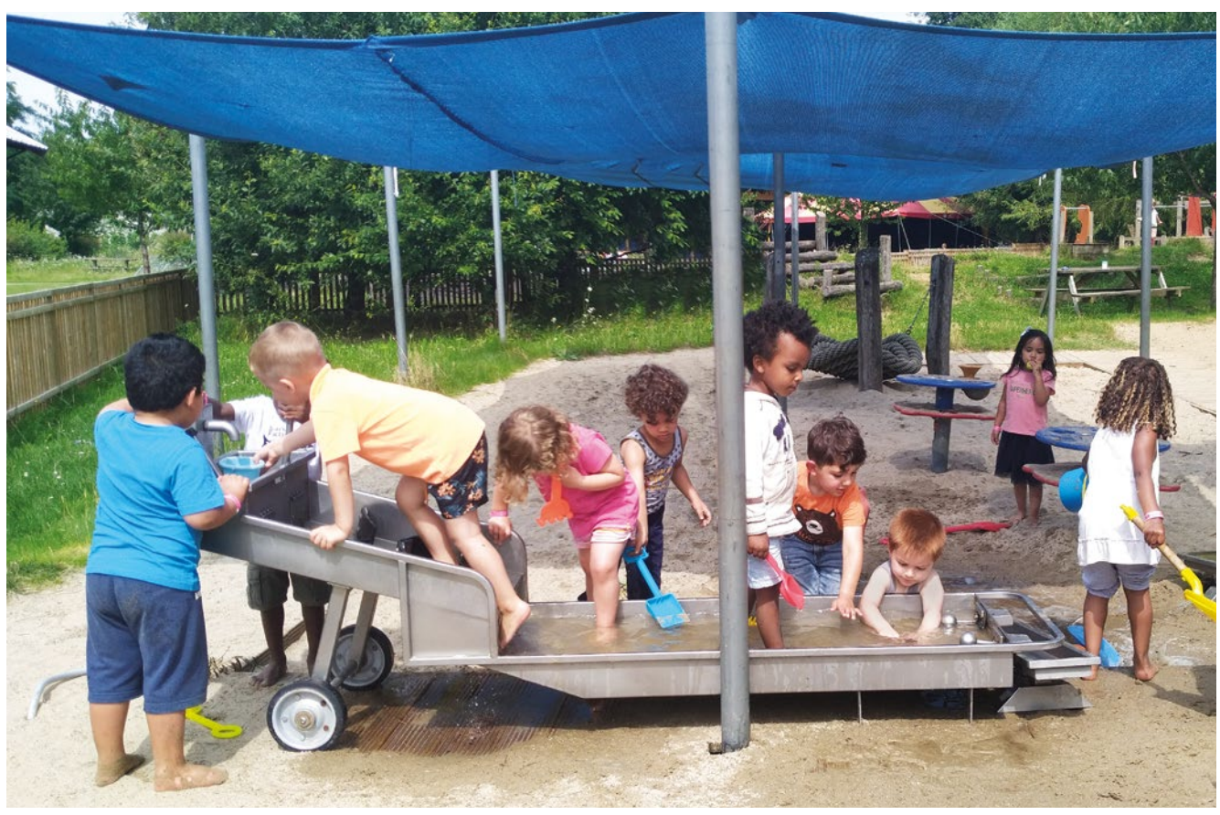
Mobile Water Playground

Overflow installations prevent flooding of the immediate area. Two steel channels at the end of the basin make sure that the dammed water flows off in a targeted way.