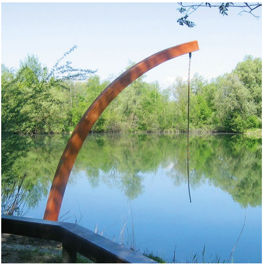
Order No. 7.64200 Tarzan Rope