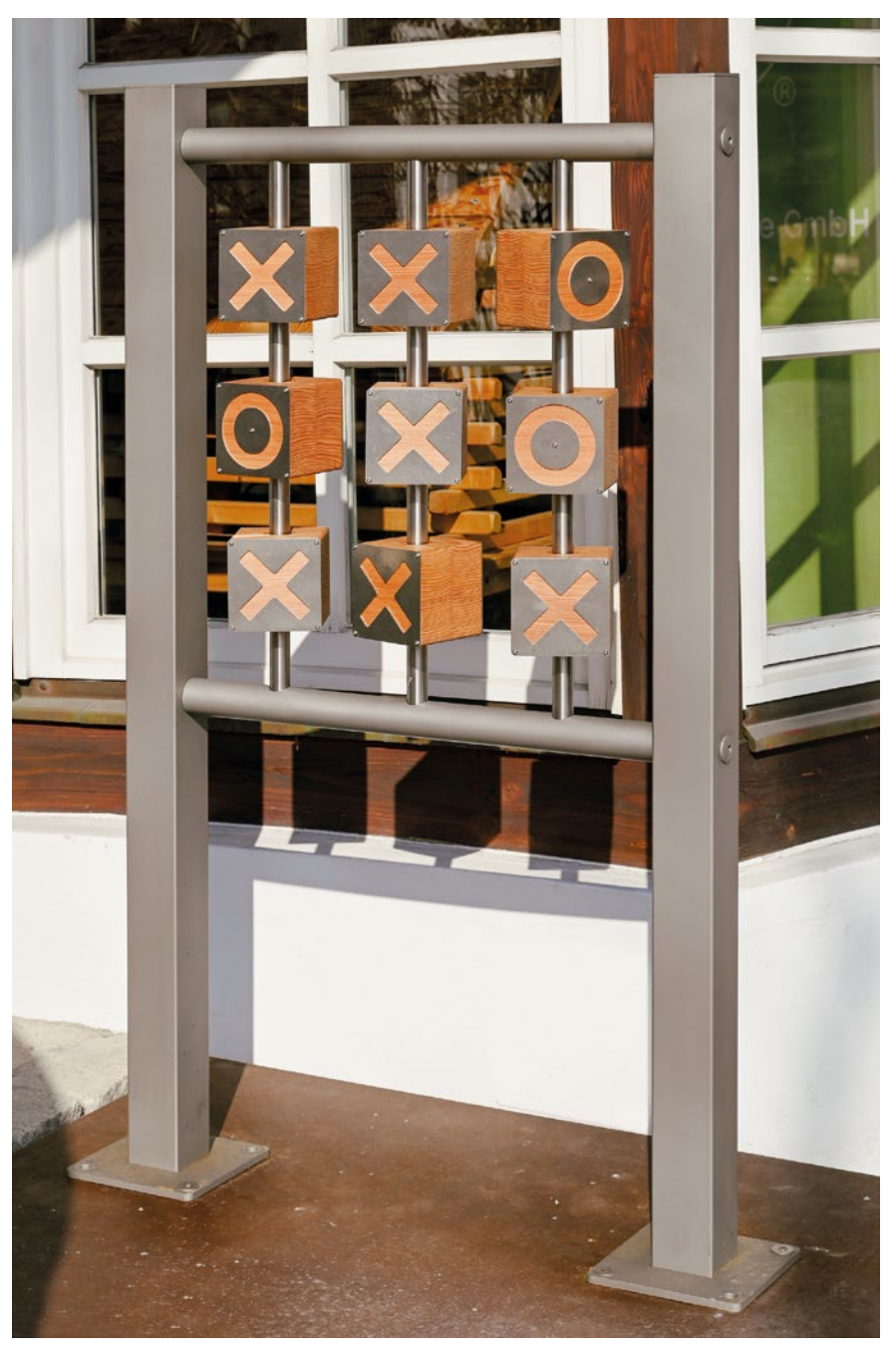
Tic Tac Toe