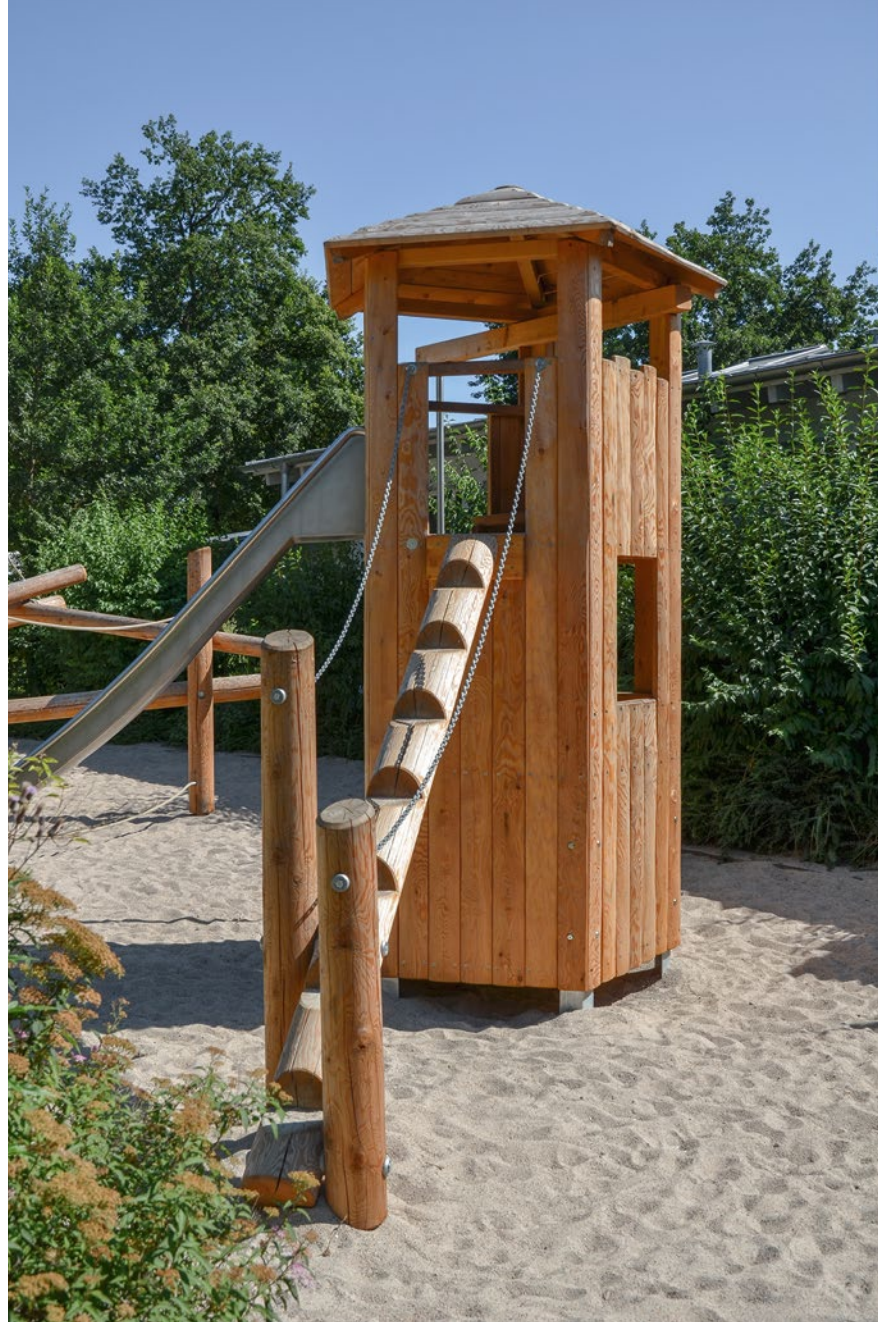
Order No. L3.20800 Pentagonal Tower with roof