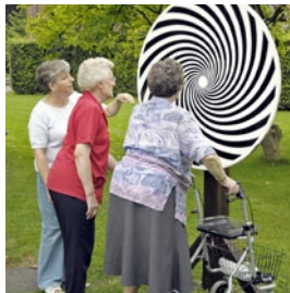
Rotating Discs Spiral