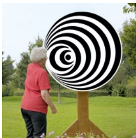
Rotating Discs Funnel