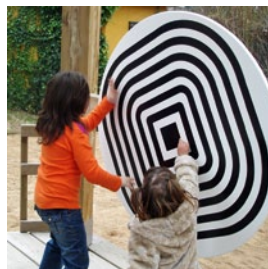
Rotating Discs Pulsation